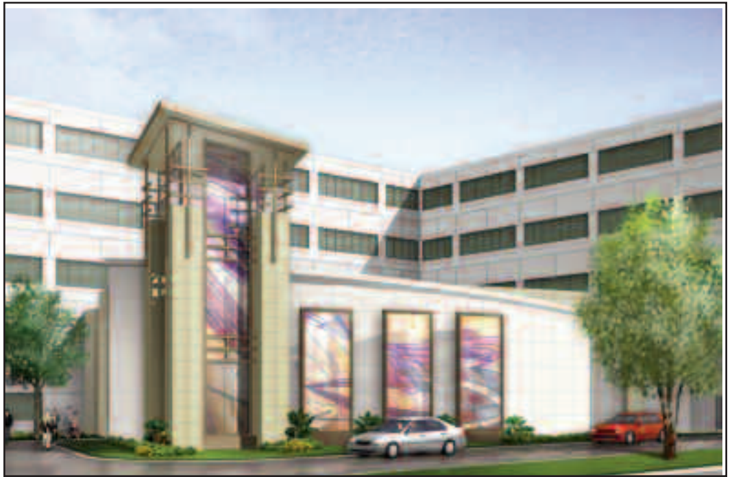
Above, an architect's rendering of the Baptist Memphis Education Center and Dr. H. Edward Garrett Sr. Auditorium. Groundbreaking for the center is scheduled for 1:30 p.m. June 23 in the Medical Plaza 3 Pavilion (the 6029 building) on the campus of Baptist Memorial Hospital-Memphis.