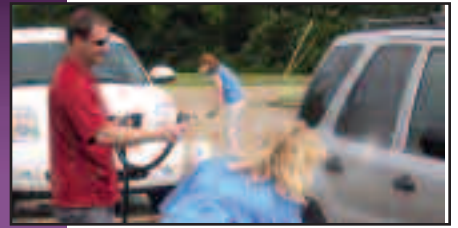
Celebrating nurses; hospital week