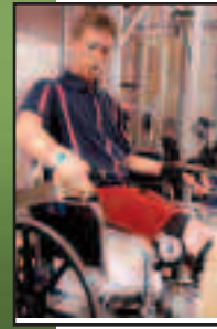
Mississippi man rehabs after rescue