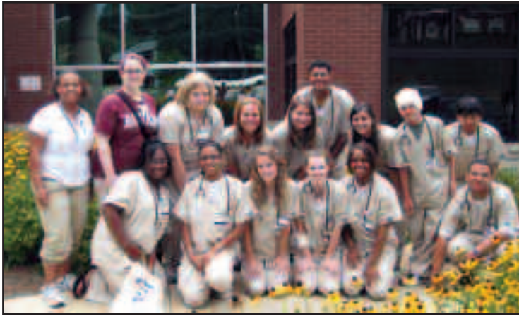
At Baptist Memorial Hospital-North Mississippi, 16 high school students recently participated in CRASH Course camp. One even traveled from out of state to stay with extended family just to attend the camp. During the camp, they received classroom instruction on different topics, made a first aid kit and learned about first aid, attended a CPR class, participated in simulation labs and toured the University of Mississippi School of Nursing.