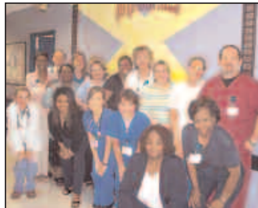
The Baptist Memorial Hospital-Memphis Emergency department team.

The McKesson Tracking Board, implemented in April 2007 in conjunction with a new triage methodology, has decreased turnaround times. The number of patients who left without being seen has declined significantly during the last six months and is below the national benchmark. The tracking board data have also aided in the reduction of nearly 15 minutes for diagnostic procedures. In addition, patients arriving by ambulance are being triaged within five minutes of arrival due to this project.