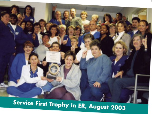
Service First Trophy in ER, August 2003