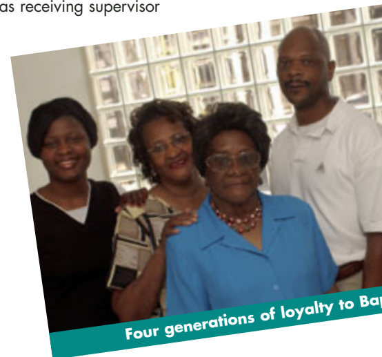
Four generations of loyalty to Baptist Golden Triangle